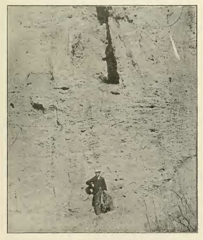
NESTING SITE OF WESTERN HORNED OWL—NEST IN THE CLEFT ABOVE THE MAN'S HEAD.

In the early part of May, 1901, while in Paonia, Delta county, Colorado, I heard of a nest of the Western Horned Owl. On the 8th we drove out there to investigate, and found the nest site in a cliff or bluff of adobe clay facing the west. The nest was 18 or 20 feet above the base of the bluff and as far or farther below its top. As we approached the place the old bird flew away.